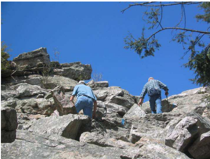
Carl and Merritt scaling the rocks