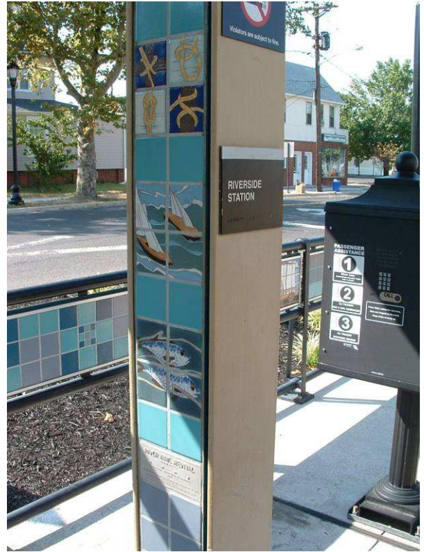
The Riverside Station