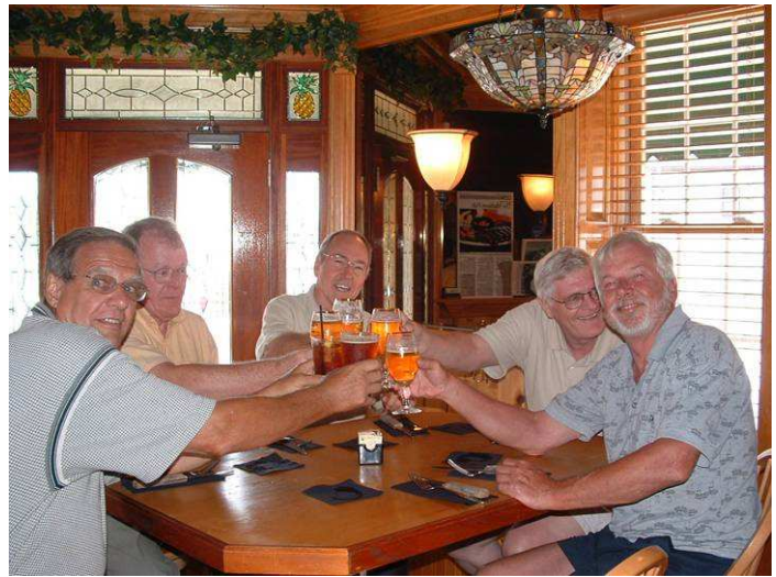
Lunch at the Madison Pub in Riverside

May 2006: Homer trip on Raillink Line – from Riverside Station to Trenton Station; back to Riverside Station for lunch at the Madison Pub; then Raillink to Camden Station where we explored the Camden end; Then Back to Riverside and home. A good day, lots of laughs!