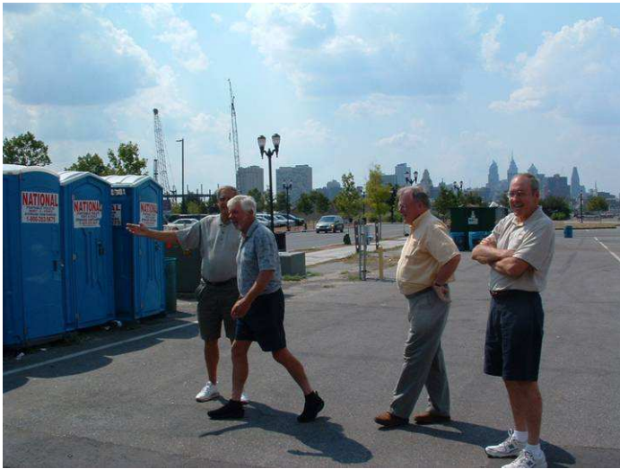
Camden end of the line – 'restroom break'!