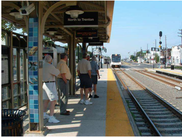
Our train approaching Riverside