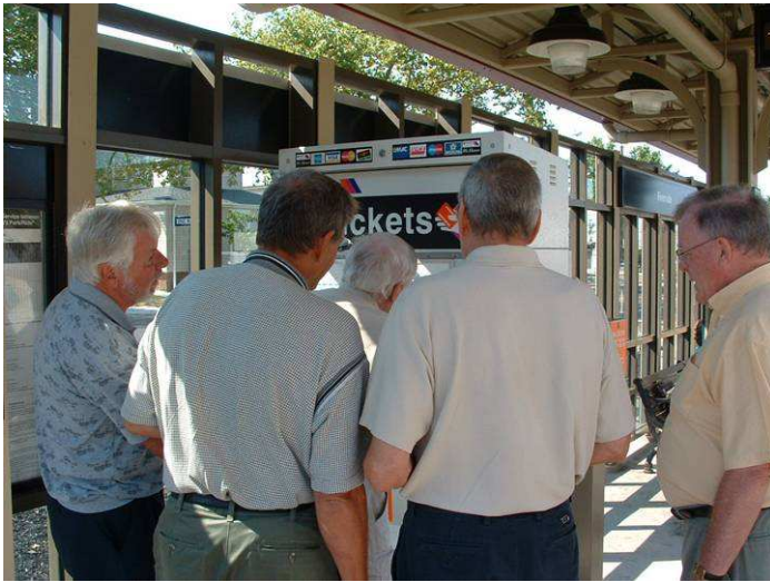
How to buy a ticket?!