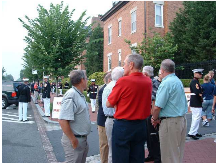
Various Homers outside of the Barracks – waiting for Marine escort to their seats