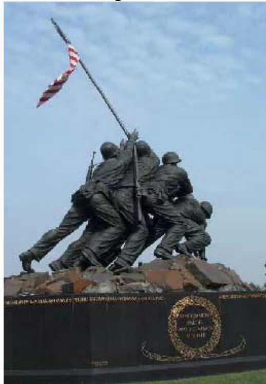
Iwo Jima Memorial the Marines' most sacred monument.