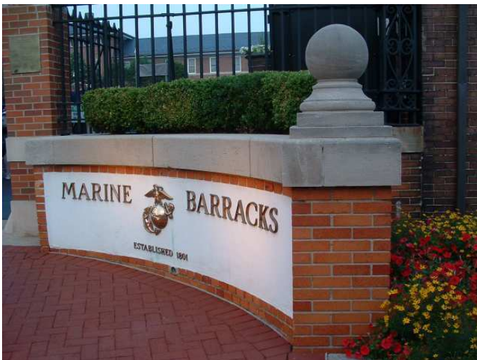
Entrance to the Marine Barracks- The Commandant's home is the Oldest building in D.C. – 1801