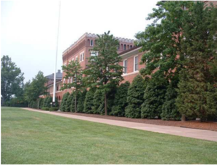
Barracks within the Marine Barracks