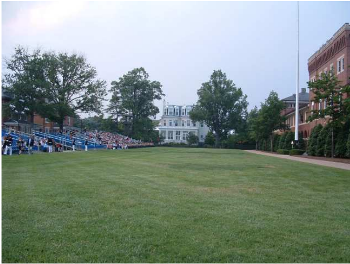
The white building in back is the Commandant's Home – with the Parade Grounds in front